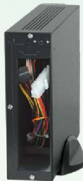
Rear Side Panel