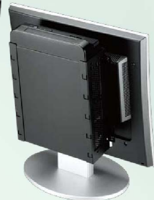
VESA Bracket (Optional)