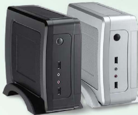
Rear Side Panel