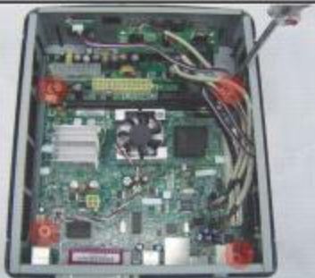
鎖主板螺絲 Screw M/B