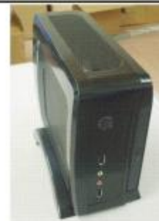
放支撐架 Put chassis on plastic stand