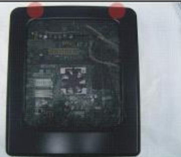
裝上蓋 Screw top cover