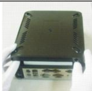
拆卸底蓋 Take off the bottom chassis