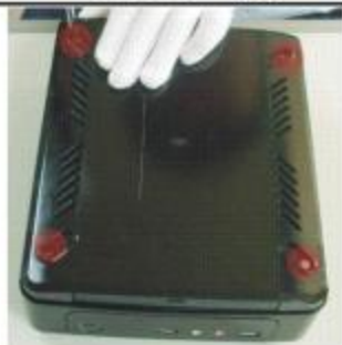
鎖底蓋螺絲 Screw bottom of chassis