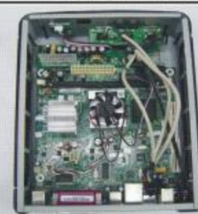
裝主板 Install M/B