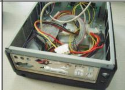
裝I/O彈片 Install I/O shield