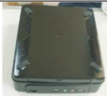
貼底蓋腳墊 Stick the bottom of foot stand