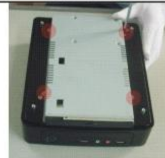
安裝HDD支架 Screw HDD bracket