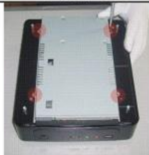
拆卸HDD支架 Take off HDD bracket