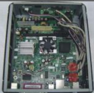
插主板線材 Insert cables on M/B