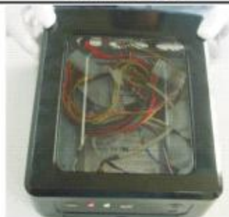
拆卸上蓋 Take off top cover