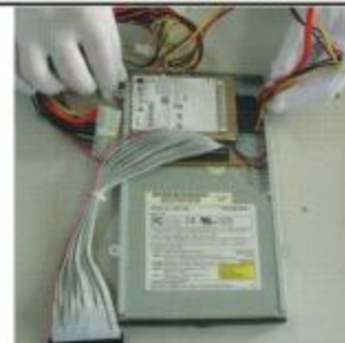
安裝DVD與HDD Install DVD and HDD