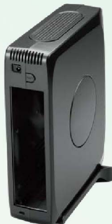
Rear Side Panel